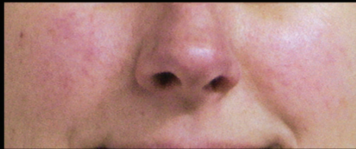
result after 1 treatment